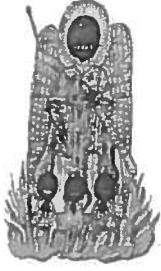
Law of Jubilees